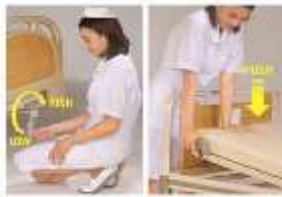
Crank operation system Back raise adjustment

A unique eye catching foldable crank is designed to give Hi-Low and adjustment.