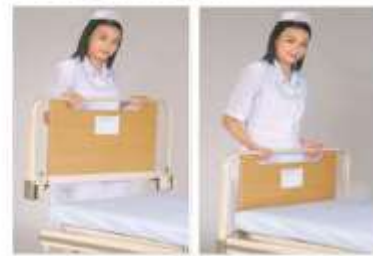
Head/foot board panel dismantle