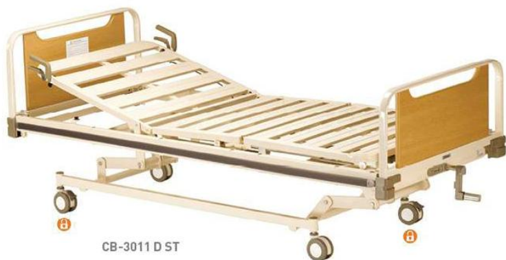
CB-3011 D ST