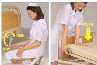
Crank operation system

A unique eye catching foldable crank is designed to give high-low bed adjustment.