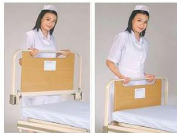
Head/foot board panel dismantle