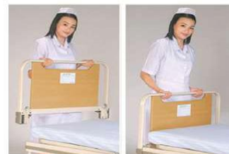
Head/foot board panel dismantle