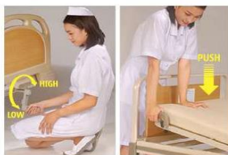
Crank operation system

A unique eye catching foldable crank is designed to give high-low bed adjustment.