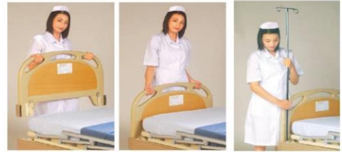
Head/foot board panel dismantle