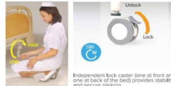
Independent lock caster (one at front and one at back of the bed) provides stability and secure parking An unique eye catching foldable crank is designed to give high-low bed adjustable