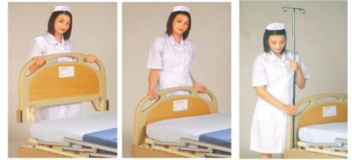
Head/foot board panel dismantle