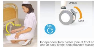
An unique eye catching foldable crank is designed to give high-low bed adjustable