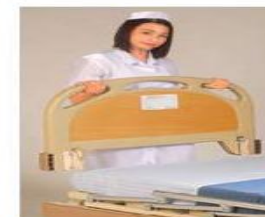
Head/foot board panel dismantle