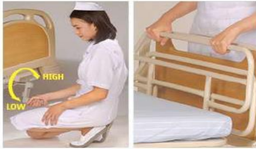
Crank operation system

A unique eye catching foldable crank is designed to give high-low bed adjustment.