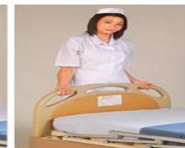
Head/foot board panel installation