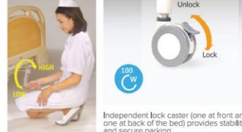
An unique eye catching foldable crank is designed to give high-low bed adjustable