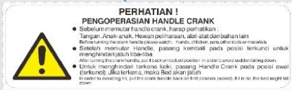
Caution Handle operation