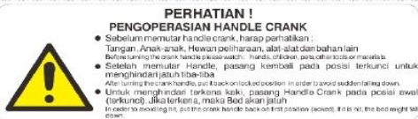
Caution Handle operation