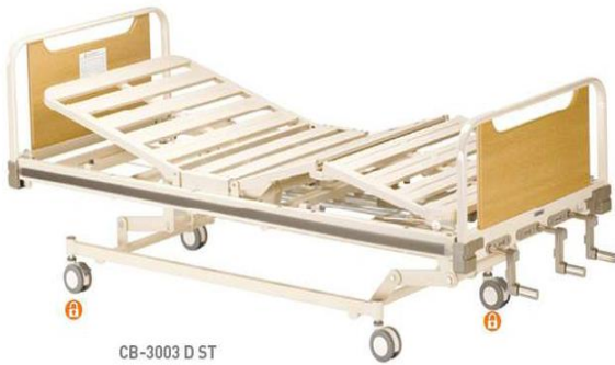
CB-3003 D ST