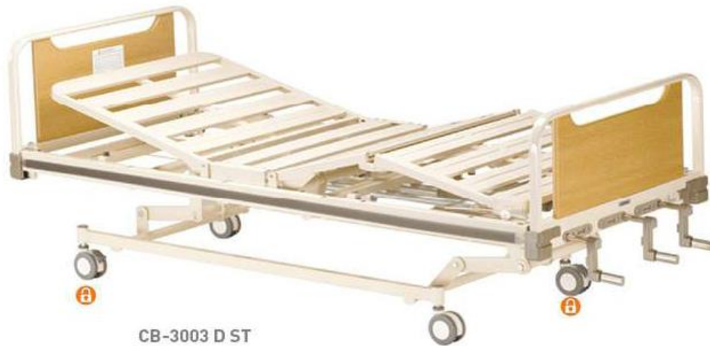
CB-3003 D ST