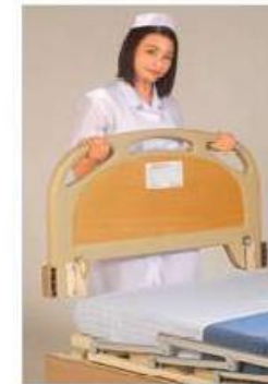
Head/foot board panel dismantle