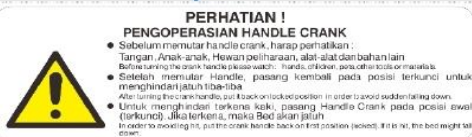
Caution Handle operation