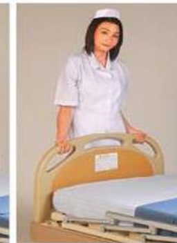
Head/foot board panel installation