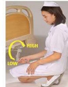
Crank operation system

A unique eye catching foldable crank is designed to give high-low bed adjustment.