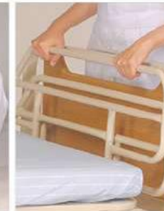
Side rail compartment (available in every nursing bed)