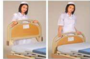
Head/foot board panel dismantle