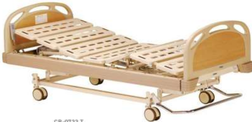
CB-0733 T with H/F Board BD-003