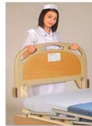
Head/foot board panel dismantle