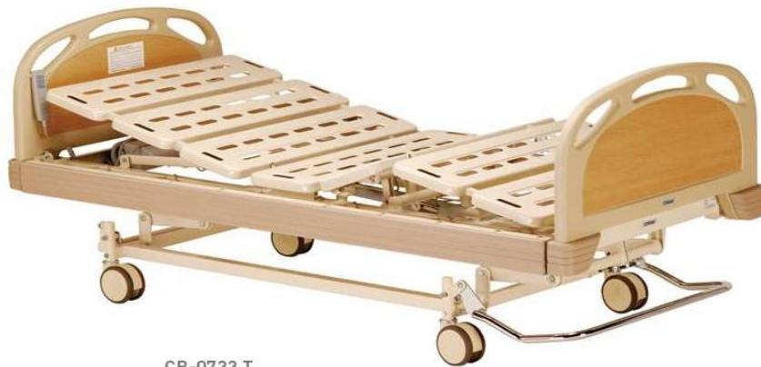
CB-0733 T with H/F Board BD-003