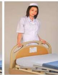
Head/foot board panel Installation