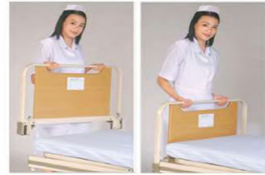
Head/foot board panel dismantle