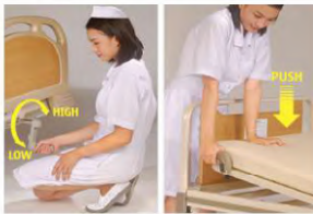
Crank operation system Back raise adjustment

A unique eye catching foldable crank is designed to give high-low bed adjustment.