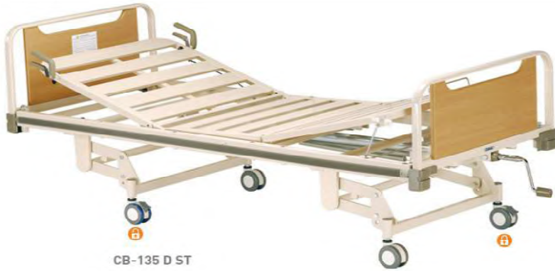
CB-135 D ST