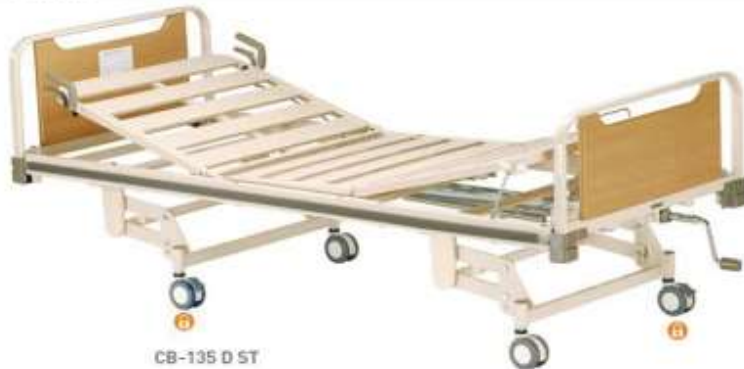
CB-135 D ST