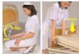
Crank operation system

A unique eye catching foldable crank is designed to give Hi-Lo and adjustment.