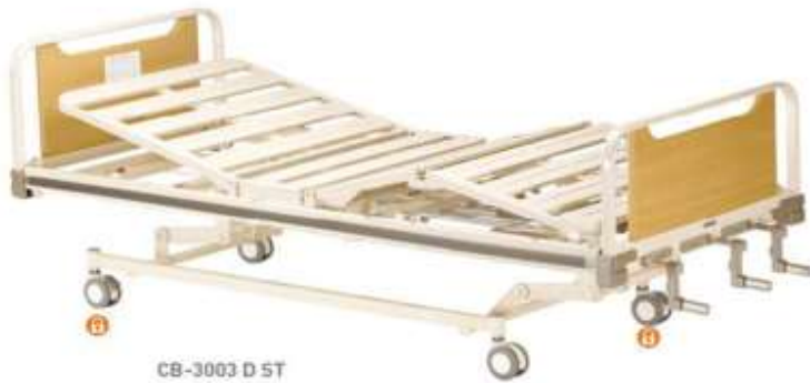
CB-3003 D ST