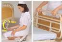
Back operation system

A crank on the side of the frame is designed for high backrest adjustment.