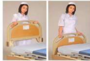
Head/foot board panel dismantle