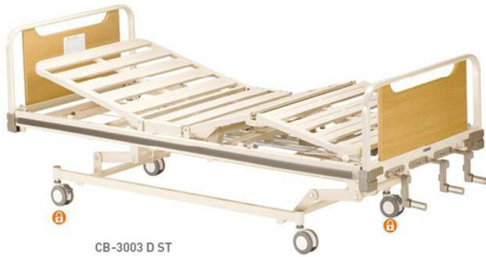
CB-3003 D ST