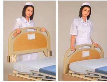
Head/foot board panel dismantle