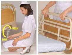
Crank operation system

A unique eye catching foldable crank is designed to give high-low bed adjustment.