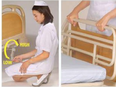
Crank operation system Side rail compartment (available in every nursing bed)

A unique eye catching foldable crank is designed to give high-low bed adjustment.