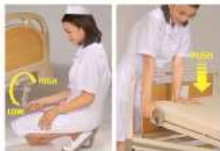
Crank operation system

A unique eye catching foldable crank is designed to give high-low bed adjustment.