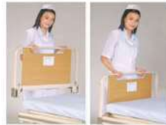
Head/foot board panel dismantle