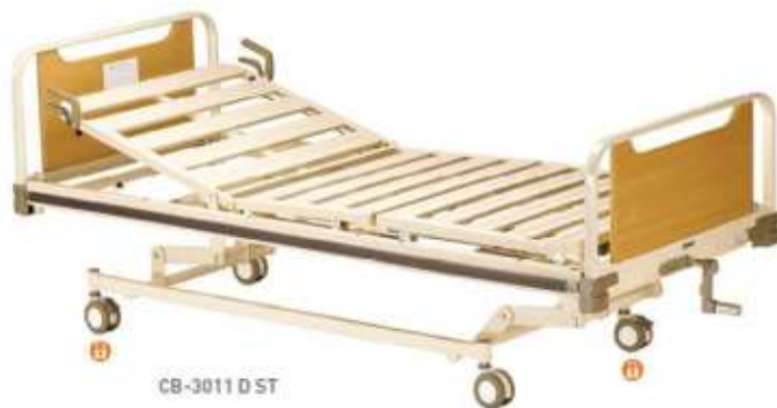
CB-3011 D ST