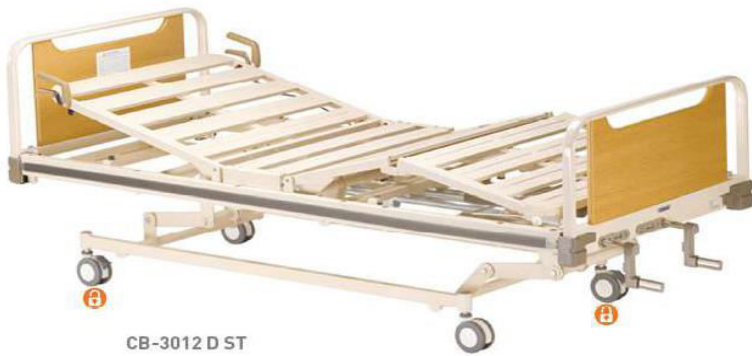
CB-3012 D ST