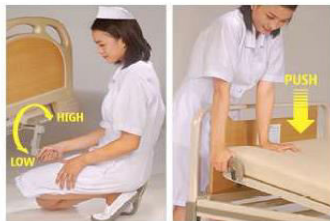
Crank operation system

A unique eye catching foldable crank is designed to give high-low bed adjustment.