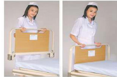
Head/foot board panel dismantle