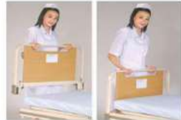
Head/foot board panel dismantle