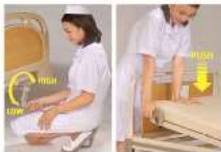
Crank operation system

A unique eye catching foldable crank is designed to give high-low bed adjustment.