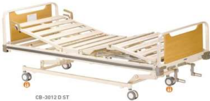
CB-3012 D ST