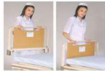
Head/foot board panel dismantle