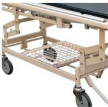
Multi purpose Tray