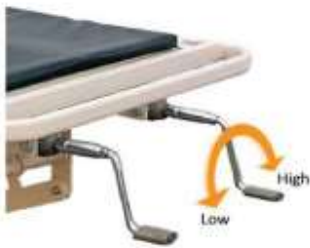
Crank Operational System