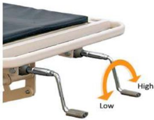
Crank Operational System