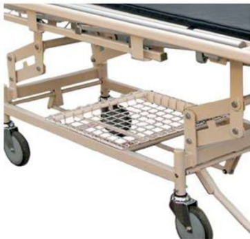
Multi purpose Tray