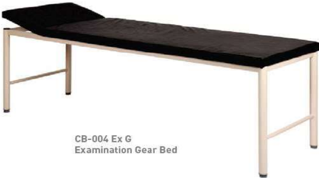
CB-004 Ex G Examination Gear Bed