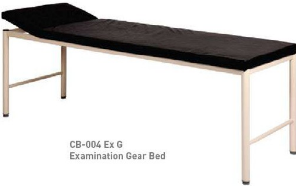
CB-004 Ex G Examination Gear Bed